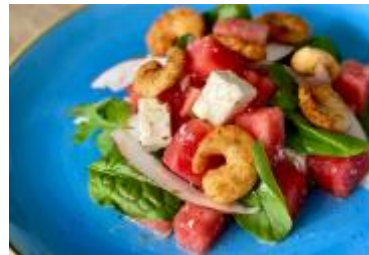
Fighting overfishing in the ocean Happy Ocean Food