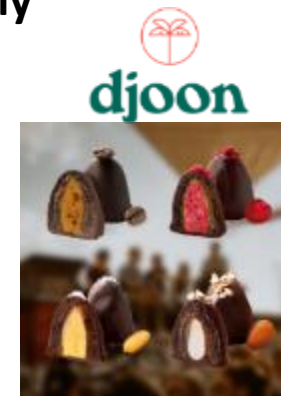
Date snacks djoon