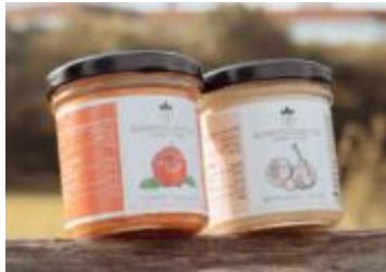
Against food waste Sonnengläschen