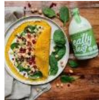
Fermented liquid dough from rice & beans Eatly