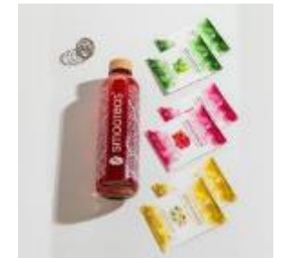
Nutritious tea Kräuterkraft